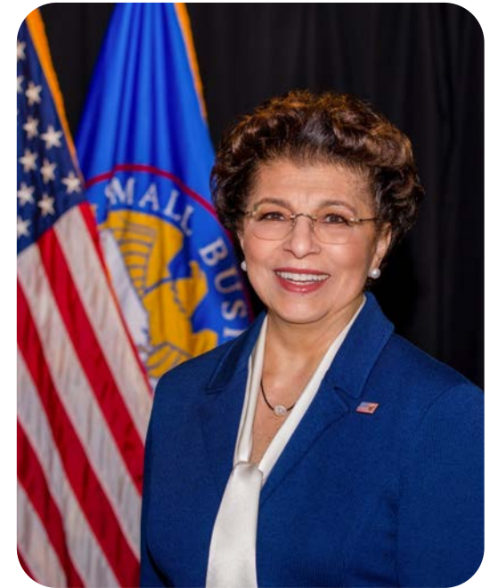
Administrator Jovita Carranza

Upon a request received from a state's or territory's Governor, SBA will issue under its own authority, as provide by the Coronavirus Preparedness and Response Supplement Appropriations Act that was recently signed by the President, an Economic Injury Disaster Loan declaration.